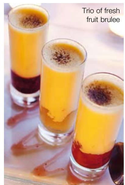
Trio of fresh fruit brulee

furnished, but we wanted to put our own individual stamp on it. It was a long, expensive process, but it was worth every minute and every penny we spent on it. We just love it.'