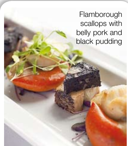
Flamborough scallops with belly pork and black pudding