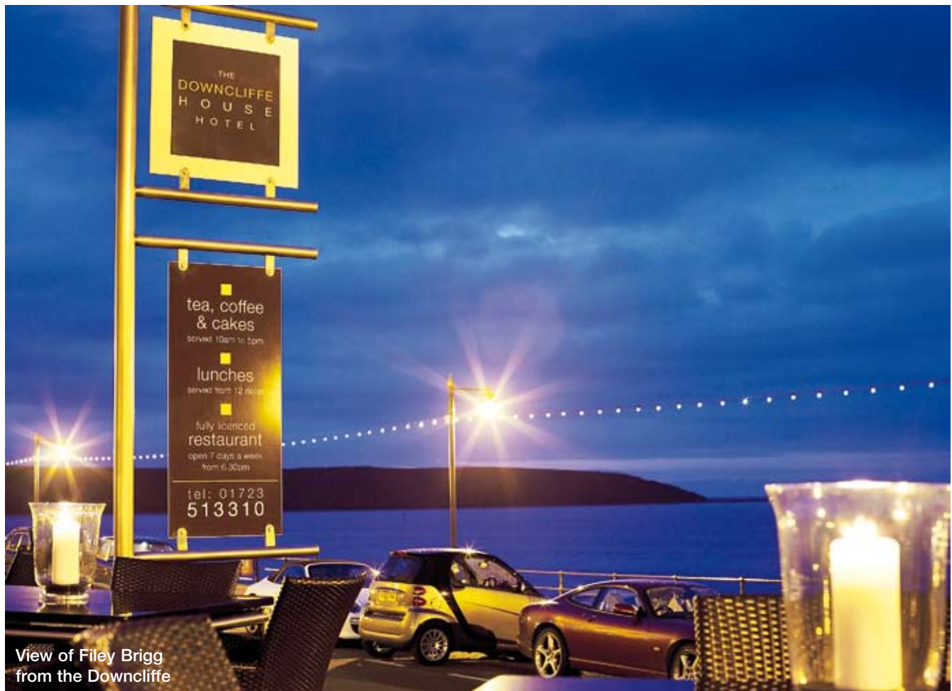
View of Filey Brigg from the Downcliffe